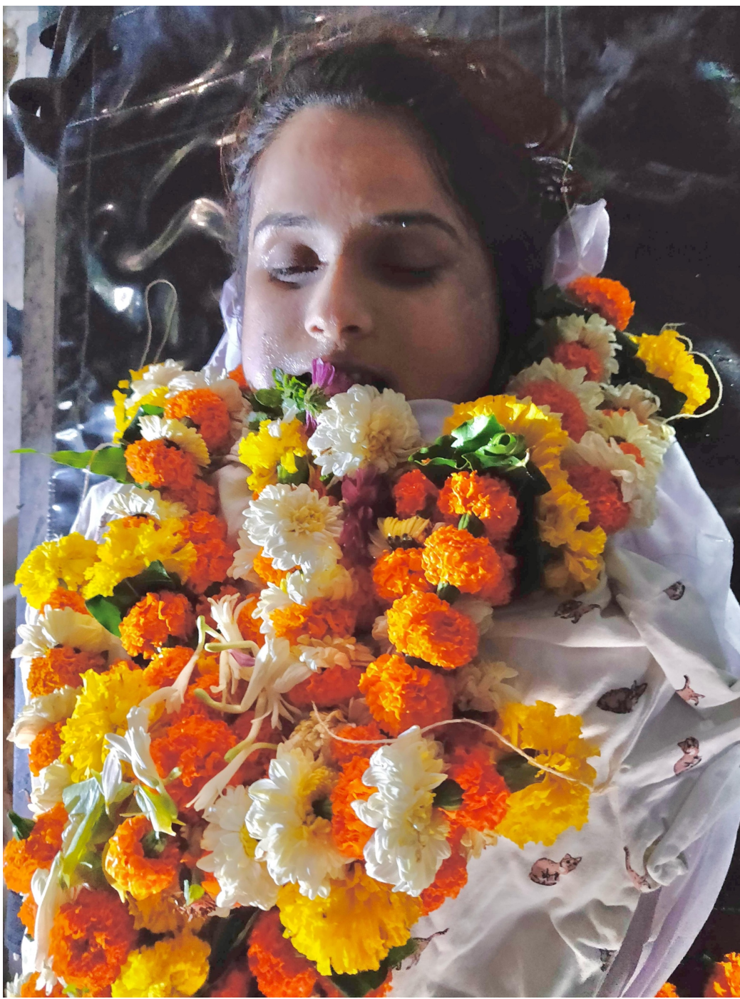
Photograph 2: Second Picture of the deceased female wrapped in white cloth with clearly visible face.

Note: None of the images has been further enhanced/morphed or modified by me or by my any associate during the examination.