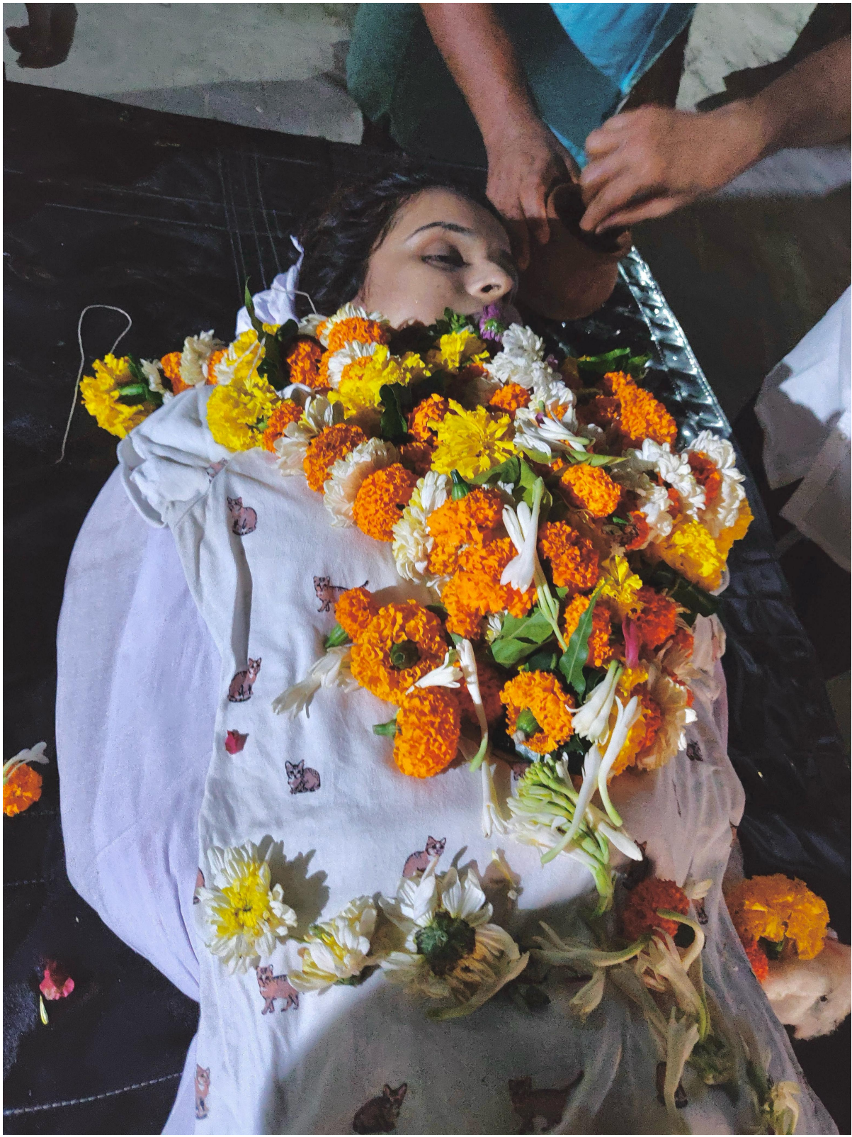
Photograph 1: Picture of the deceased female wrapped in white cloth with visible face.